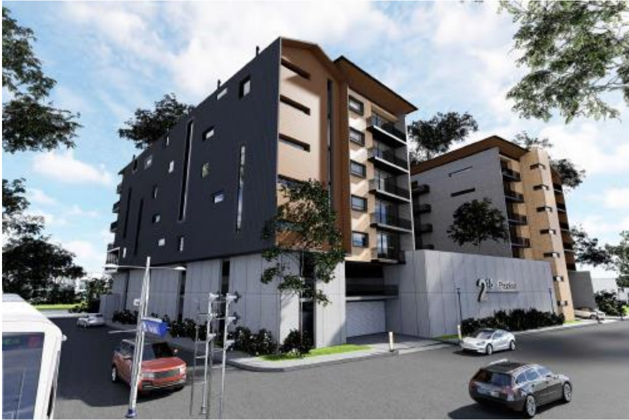
Perspective showing view at intersection of Paxton and Lucy Aves.